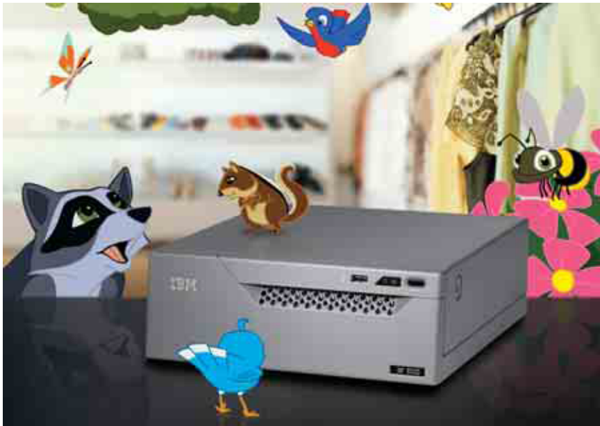
IBM SurePOS 300 Series