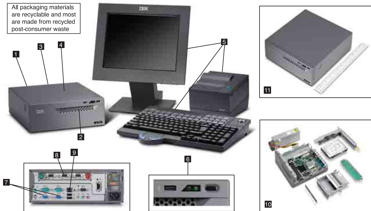
IBM SurePOS 300 system with optional IBM modular CANPOS (Compact AlphaNumeric Point-of-Sale) keyboard, IBM SureMark single-station printer, IBM SurePoint 12" display

than 30 years. With 2.5 million POS terminals installed in over 100 countries, IBM is the global leader in point-of-sale. Retailers know they can depend on IBM technology and leadership.